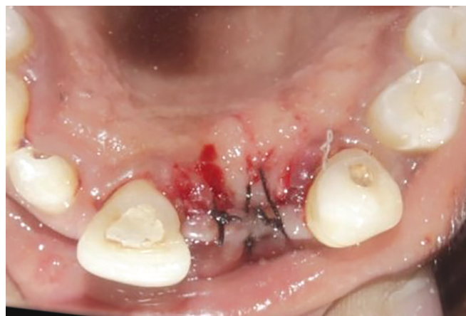
Fig. 4: Flaps approximated using simple interrupted sutures