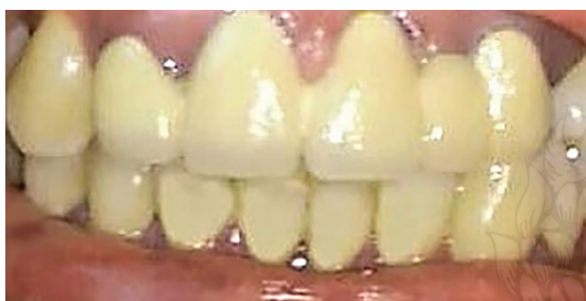
Fig. 7: Six months postoperative picture following all ceramic crown placement

drawing a detailed treatment plan is necessary to define a functional and prosthetic rehabilitation.