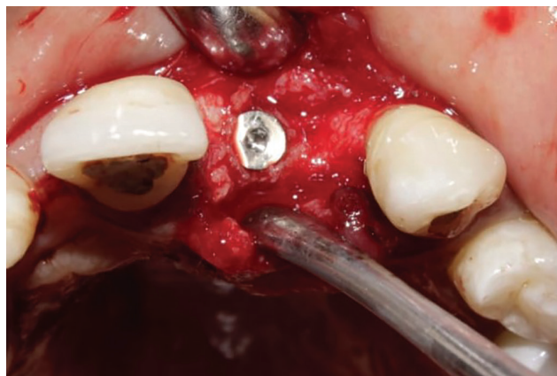
Fig. 3: Flaps raised under LA and implant of size 3.75 x 11.5 mm implant placed