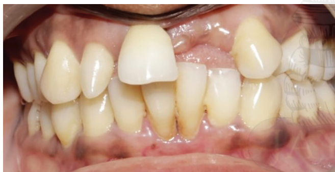
Fig. 1: Preoperative clinical photograph showing missing 21 and 22. Flared 11, mesially tilted 23, peg laterals in 12

The rehabilitation of an unesthetic smile in maxillary anterior region in this case was a clinical challenge, when it involves missing teeth, and various anatomical and developmental abnormalities such as peg laterals, abnormal spacing between teeth, variation in the position of the teeth such as proclination and rotation. Hence,