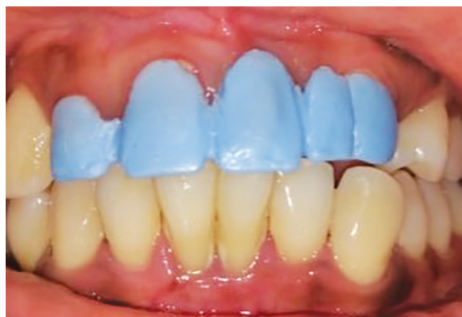
Fig. 6: Mock up trial for 12 (peg laterals), 11 (flared), 21(implants), 22 (pontic), 23 (mesially tilted)