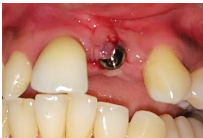
Fig. 5: Healing abutment placed in relation to 21