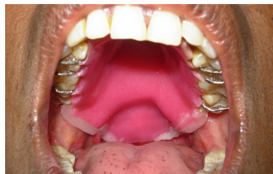
Fig 4: Intra oral view of the final denture with soft liner