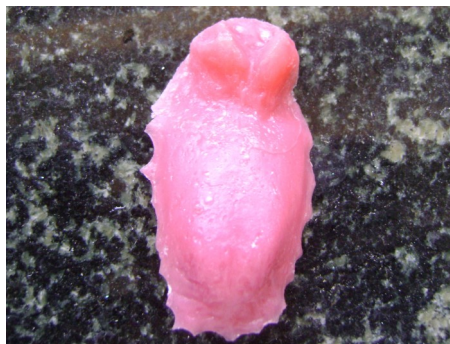
Fig 2: Custom tray with Pharyngeal bulb