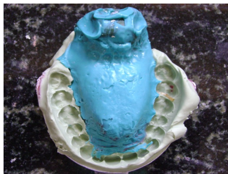
Fig 4: Pick up impression