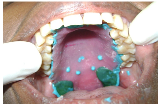
Fig 3: Final impression